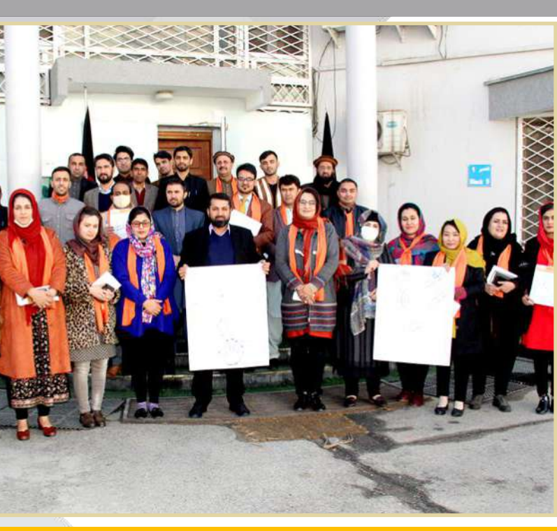
INITIAL MEMBERSHIP TRAINING CONDUCED TO 300 BENE-FICIARIES OF WEE-RDP