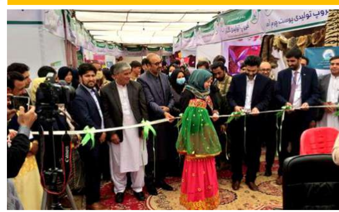
WEERDP CONVENED VILLAGE BAZAR EXHIBITION IN HERAT PROVINCE

Economic Empowerment Rural Women Development Program (WEE-RDP) of Ministry of Rural Rehabilitation and Development (MRRD) organized an exhibition on local level titled "Village Bazar" in Herat province. The program convened the exhibition at a time everything was normal post COVID-19 outbreak in the country.